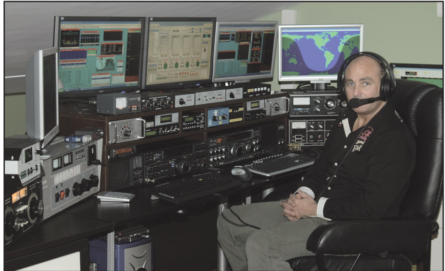
Shack of EA1DR, who submitted the top score in Spain in 2011 and tied for 4th place in Unlimited Class.

Note: Top scorers in some countries received plaques. Complete listing of all country leaders is available on the CQ website.