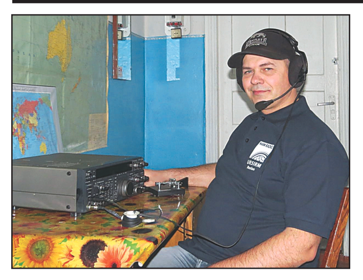
UR5IRM is the 2014 Formula Class winner.